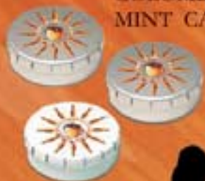
COLOMBIANO MINT CANDY

THANKS TO OUR UTMOST ATTENTION TO PROFITABILITY, COLOMBIANO COFFEE HOUSE® (CCH) FRANCHISEE BENEFITS FROM A LOW INVESTMENT AND A HIGH RETURN, ACHIEVED THROUGH WELL BALANCED F&B AND EMPLOYEES COST, THEREFORE REDUCING CONTROLLABLES AND MAXIMISING PROFIT. OUR PRESTIGIOUS, YET YOUNG AND DYNAMIC BRAND TAKES FULL ADVANTAGE OF THE GROWING TREND IN THE COFFEE HOUSE SEGMENT, THUS HELPING THE CCH FRANCHISEE BECOME A LEADER IN THE BUSINESS OF SERVING QUALITY COFFEE. TOGETHER, WE CAN ACHIEVE A MUTUALLY SUCCESSFUL PARTNERSHIP THAT WILL HELP PROMOTE THE SPIRIT OF THE COLOMBIANO COFFEE HOUSE® EXPERIENCE IN ADDITION TO EXPERIENCING LATINO LIVING WORLDWIDE.